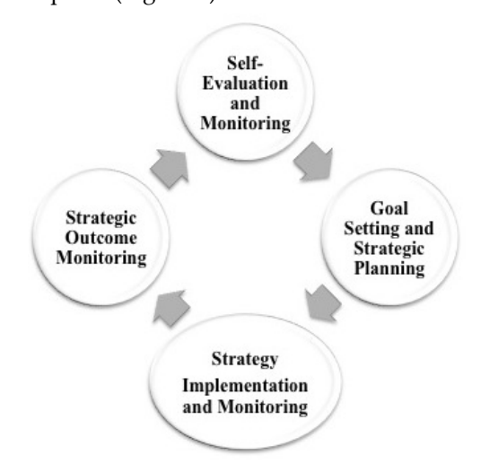
Fig. 1. A cyclical model of self-regulated learning (Zimmerman, 1998, pag. 83)

In this regard, Hacker et al (sd) refer that learners can be agents of their own thoughts and behaviors, can monitor their knowledge or skills, establish their learning objectives, outline and control strategies / plan to achieve them, monitor progress for their possible adjustments and, finally, assess whether the objectives were achieved. All this translates into what Zimmerman (2000) calls self-regulation of behavior. According to this author the concept of self-regulation can be defined as self-generated thoughts, feelings and actions for attaining academics goals (Zimmerman, 1998). The key element of self-regulation is self-monitoring that involves the observation and monitoring of the performance itself, as well as its results. This in order to understand their learning process and apply these strategies in future situations, where they will prove to be adequate (Figure 1).